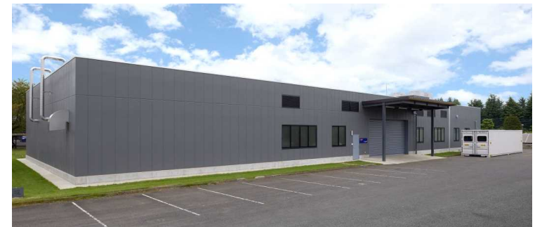
Battery Safety Testing Center

Supports the implementation of testing and certification application services compliant with United Nations regulations on the safety of automotive rechargeable batteries.