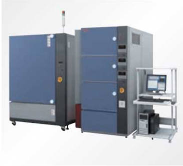
Secondary Battery Charge-Discharge Evaluation System