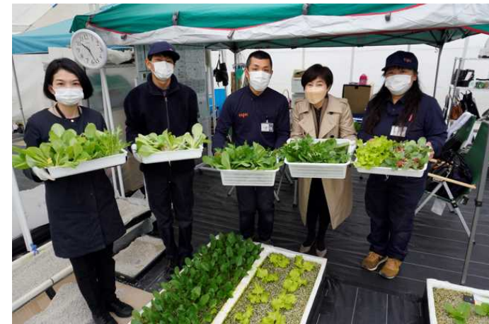
Employees picked vegetables as a team