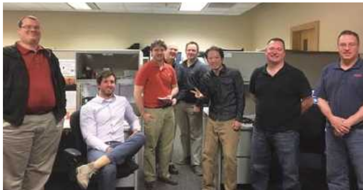
On-site training in the Global Trainee Program (U.S.)