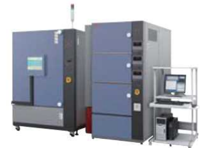
Secondary Battery Charge-Discharge Evaluation System