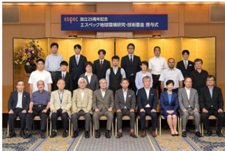
FY2022 award ceremony and 25th anniversary commemorative ceremony