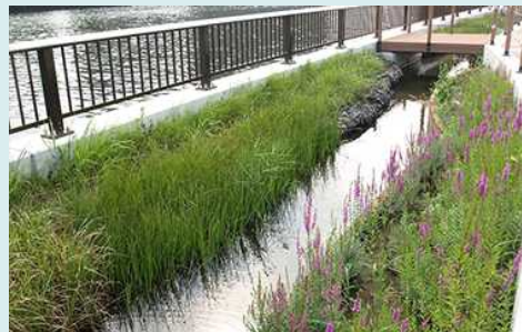
Waterfront biotope restoration on the Sumida River Terrace in Tokyo