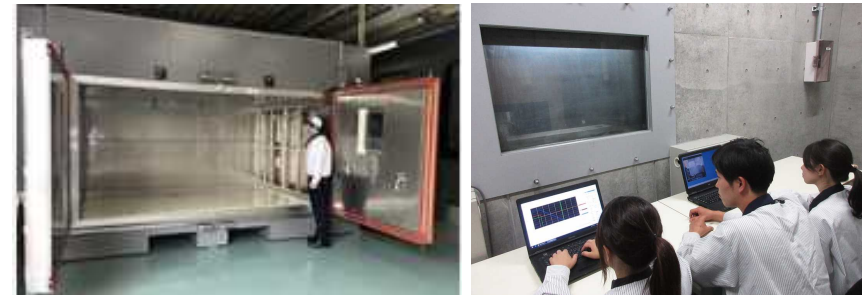
Capable of performing various safety tests for secondary batteries compliant with United Nations regulations and other standards