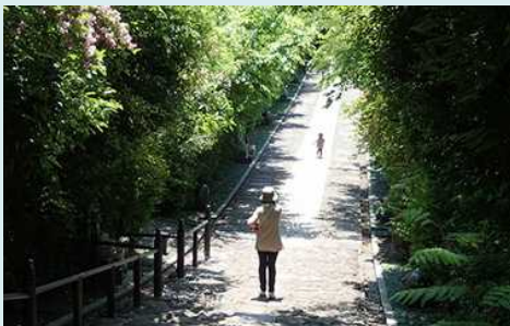
A forest restored along the approach to Rinno-ji Temple in Sendai

Environmental conservation business to restore the natural environment, including reforestation (tree planting) that contributes to biodiversity and CO2 fixation, waterfront biotope restoration to restore natural rivers, and grassland creation using native species.