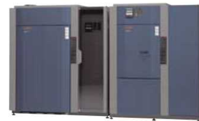
Burn-In chamber for semiconductor inspection