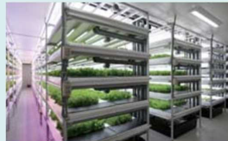
Plant factory using deep sea water Produce and sell vegetables high in minerals

Provide plant factories and research devices that can efficiently produce vegetables by controlling temperature, light, and other factors, as well as systems such as aquaponics that circulate water and nutrients to grow vegetables and fish together.