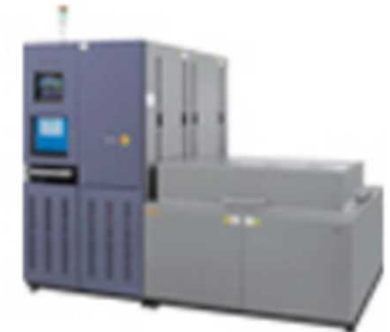
Power Cycle Test System for Power Device