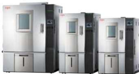
Temperature & Humidity Chamber "Platinous J series"

Supply products such as Freezer for Temperature Controlled Transport for transporting biopharmaceuticals etc. and stability test chambers for pharmaceuticals etc.