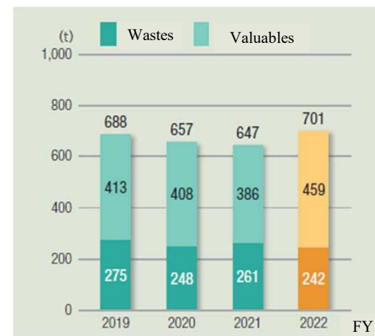
Total amount of Discharge (non-consolidated)