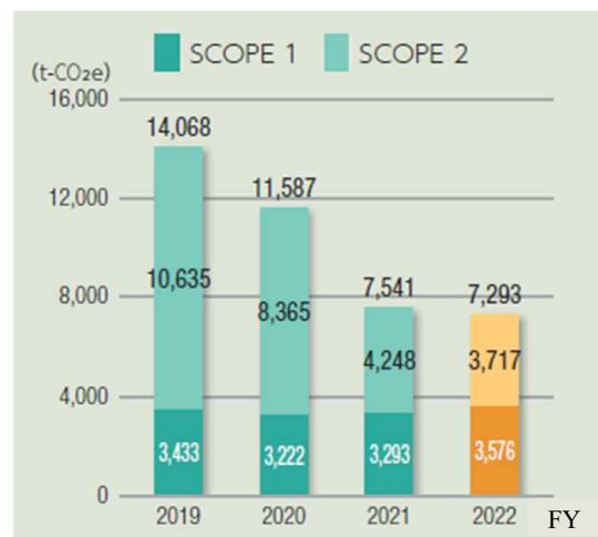
Greenhouse gas emissions Total of SCOPE 1 + 2 (in-house emissions) (consolidated)