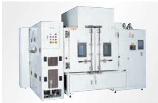
Fuel Cells Evaluation System