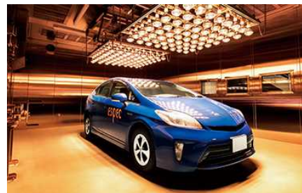
Drive-In Chamber for Vehicle Testing