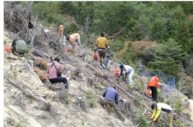
The 3rd Tree-Planting Festival Seeds were selected based on carbon fixation and biodiversity functions.