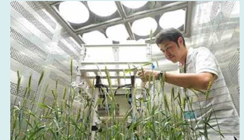
Experimental System for Analyzing Responses of Dryland Plants to Climate Change (Arid Land Research Center, Tottori University)