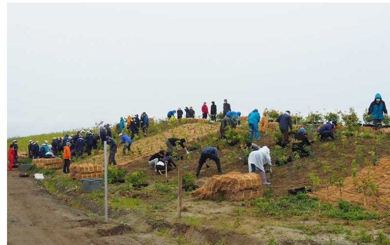
Tree Planting Ceremony