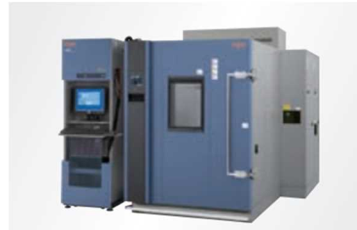
Temperature Cycle Test System for Solar Battery Modules