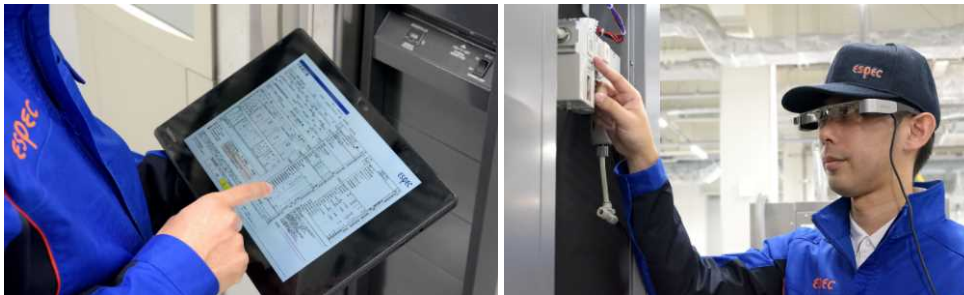
Technical support using IT

Provide laboratory testing services based on technologies and testing expertise developed through environmental tests.