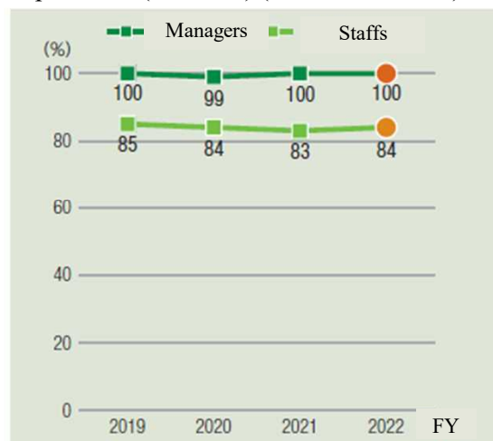
Certification acquisition rate for the Certification Test for Environmental Specialists (Eco Test) (non-consolidated)