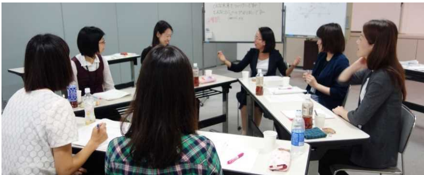
The female leadership development program

From the Ministry of Health, Labor and Welfare: The Company received the "Kurumin" certification, which is granted to companies that support child-rearing. And the highest ranking of the certification mark "Eruboshi" based on the Act on Promotion of Women's Participation and Advancement in the Workplace.